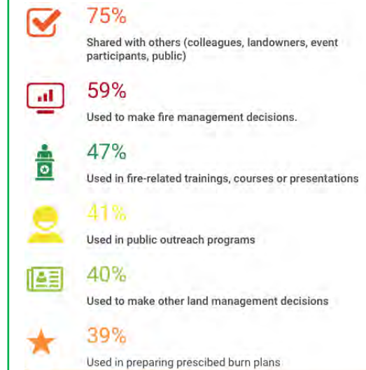
Figure 3. How managers and practitioners use information from SFE (2017 UNR FSEN Survey)

One of the plenary talks and several special sessions are specifically planned to showcase JFSP, FSEN and SFE programs and accomplishments. Two of the interactive fire circles have been designed to solicit information about SFE impacts on regional fire management as well as to gather feedback on regional research and science needs – all of which we will use to guide future SFE programming. SFE has been instrumental in working through the Fire Congress Planning Committee to encourage conference presenters to submit a short ‘Research Highlight’ document related to their presentation that describes the management implications and applications of their