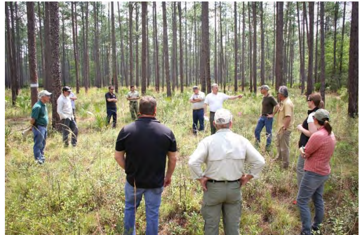
In the spring of 2017, SFE and the Osceola National Forest hosted the JFSP Board and Program Office for a field tour in the Osceola National Forest.

In FY17 the Southern Fire Exchange (SFE) had another milestone year. We met goals for fire science delivery with partners and stakeholders while also expanding our audience (see Table 1). Program participation (see Table 2) and post-event surveys, demonstrate that we are a successful and innovative fire science delivery program for the South. We wrapped up FY17 with a new half-time outreach specialist who brings valuable experience and strengthened connections to the Southern Regional Extension Forestry (SREF) program.