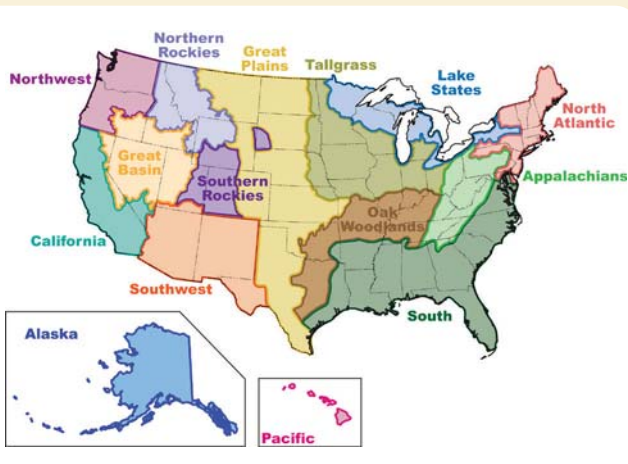
The SFE covers eleven states in the South and is a member of the JFSP Fire Science Exchange Network.

Representing 11 southern states, the Southern Fire Exchange is building on the long history of fire science delivery and outreach that already exists in the South. We work closely with our neighbors in the Oak Woodlands and Forests Fire Consortium and the Consortium of Appalachian Fire Managers and Scientists (CAFMS) to share information and resources across state and ecosystem boundaries in the region.