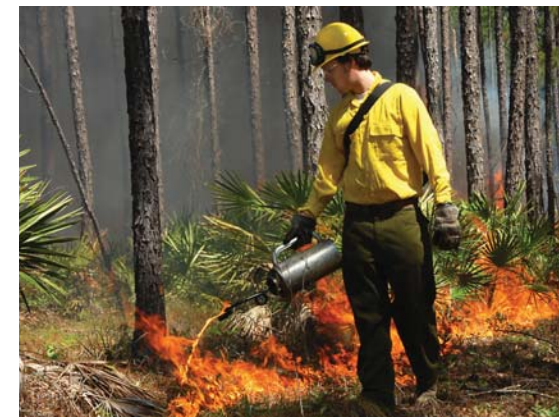
Practitioners and managers can access recent research results and resources for educating the public through SFE fact sheets, newsletters, and presentations.

SFE has science-based fact sheets and other materials that the fire community can use in a variety of public education settings.