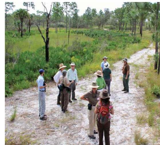
The SFE provides on-the-ground learning opportunities, such as field tours and workshops, for both fire managers and researchers.

Fire research results and summaries are disseminated to end users through the bimonthly Fire Lines newsletter, fact sheets, and presentations available on our website and through Prescribed Fire Council meetings, workshops, and webinars.