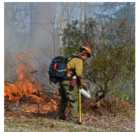
In early March, nearly 2,000 acres were burned in northern Georgia on the Bull Mountain Cooperative Prescribed Burn. Click here to see more photos.