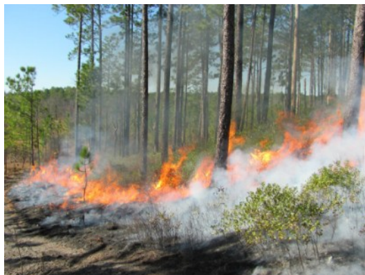
Prescribed fire at Calloway Forest in North Carolina, where 180 acres were burned in January. Click here to see more photos on The Nature Conservancy's North Carolina Chapter Facebook page.