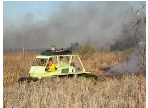
Left: More than 2,000 acres were burned January 31 at Merritt Island NWR in Florida. Check out the Kennedy Space Center in the background! Right: Prescribed fire being conducted on February 2 at Ace Basin NWR in South Carolina. Click here to check out more USFWS SE Region Fire Management Photos.