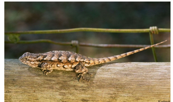
Fence lizards were most abundant two years after the burn.